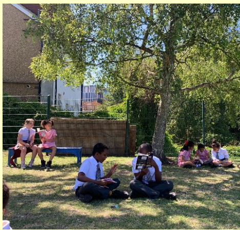
Newton Class enjoying the beautiful weather